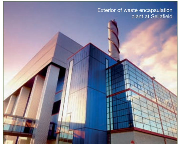
Exterior of waste encapsulation plant at Sellafield

Radioactivity is the process by which the atoms of some elements disintegrate and emit ionising radiation.