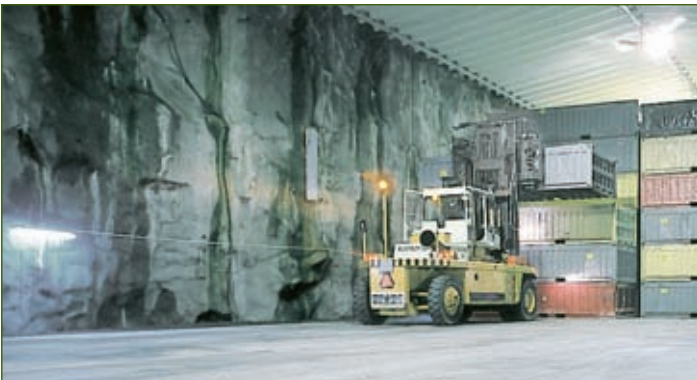
Placement of container in rock cavern in SFR