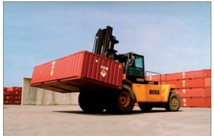
Low level waste repository at Drigg in Cumbria

It is often said that 'no level of radiation is safe'. The reason for this is that the likelihood of radiation causing cancer or hereditary effects is related to the dose and its rate of absorption – the larger the dose the greater the risk and the smaller the dose the smaller the risk. For precautionary reasons, it has been assumed that there is an ever decreasing, but still positive risk, as the dose approaches zero, and that the risk is greater if the exposure is brief than if the dose is accumulated over a long period.