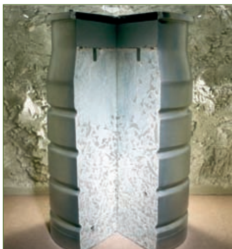
ILW grouted drum (encapsulation)