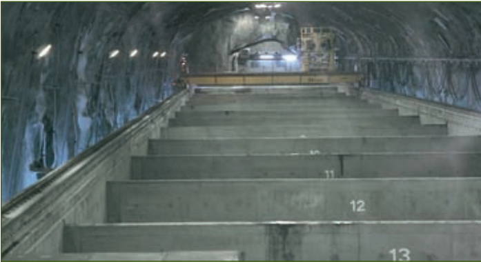
Rock vault in SFR divided into shafts. Here, intermediate level waste is kept in drums or moulds (containers made from concrete walls). When the shafts are full, they are sealed with concrete blocks. This is done by remote controlled cranes