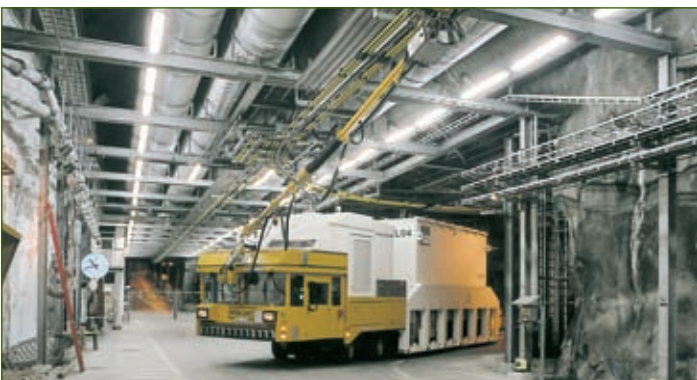
Transport underground in SFR