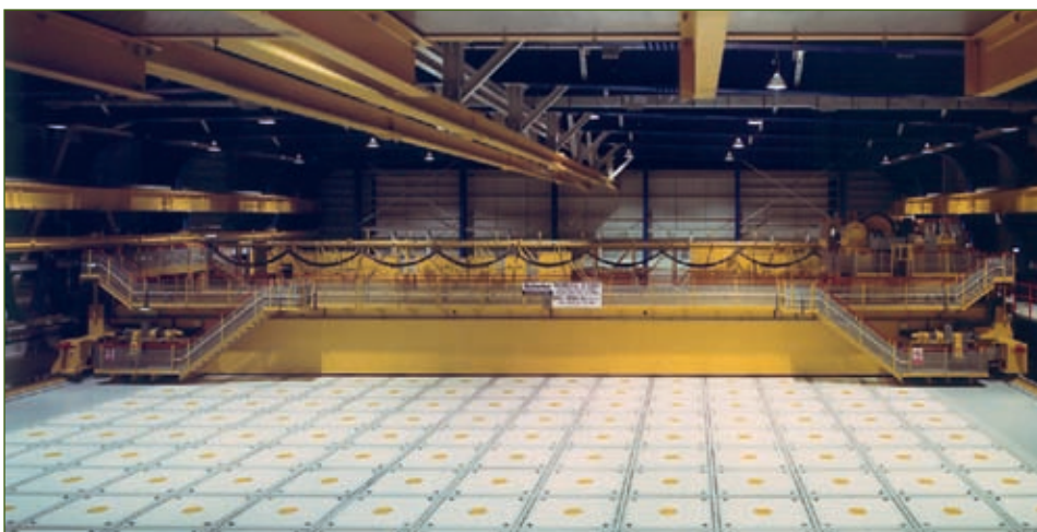
Intermediate level waste (ILW) store at Sellafield

As might be expected when most of the radiation absorbed by people is from nature, there is no evidence for this. Indeed, the precautionary linear no threshold (LNT) theory, as it is described, is contradicted by the hormesis theory which, loosely translated, argues that a little radiation does you good in the sense that, as with other toxic substances, small doses can stimulate the immune system. The issue is the subject of much scientific debate.