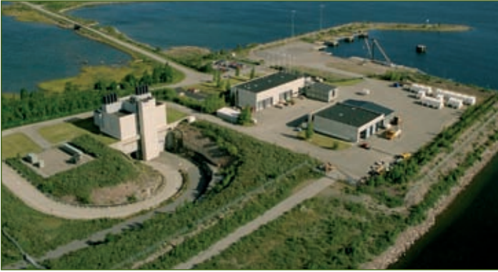
Aerial view of SFR, Sweden's underground repository for the final disposal of low and intermediate level waste